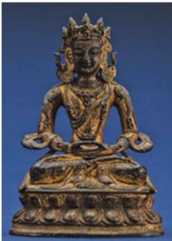
Gold lacquered bronze

Other key highlights include 18th - 20th century Tibetan thangkas and Nepalese paubha paintings based on Buddhist and Hindu iconography. Also on offer are Buddhist sculptures, a bronze sculpture of Shiva-Parvati, and ritual implements. Himalayan art forms an important part of India's cultural her-