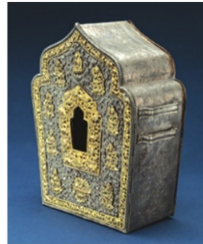
Parcel gilt silver and copper

At the forefront of selling Indian art, they hold online and live auctions, exhibitions, and prime property sales throughout the year. Their focus is to bring transparency to the auction process, and providing easy access to bidders around the world. Saffronart's services go beyond auctions to include private sales, art storage, appraisals and valuations for our clients, and supporting the efforts of the Indian art world by holding fundraiser auctions.